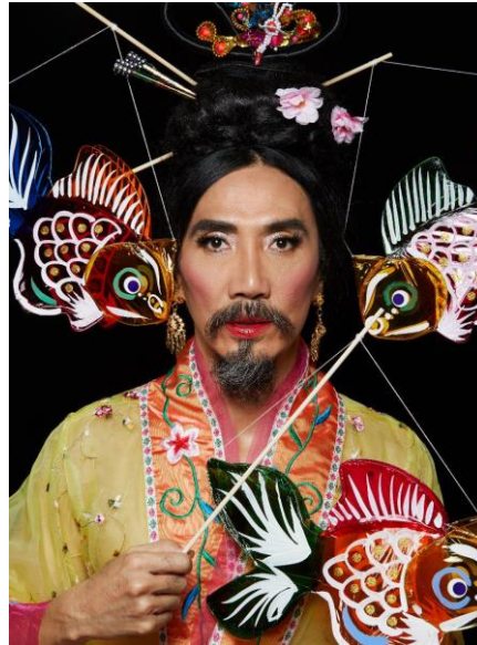
Yang Derong, Face of the Day , 2017–2018, mixed media.

Presenting fresh perspectives of humanity through digitally led innovations